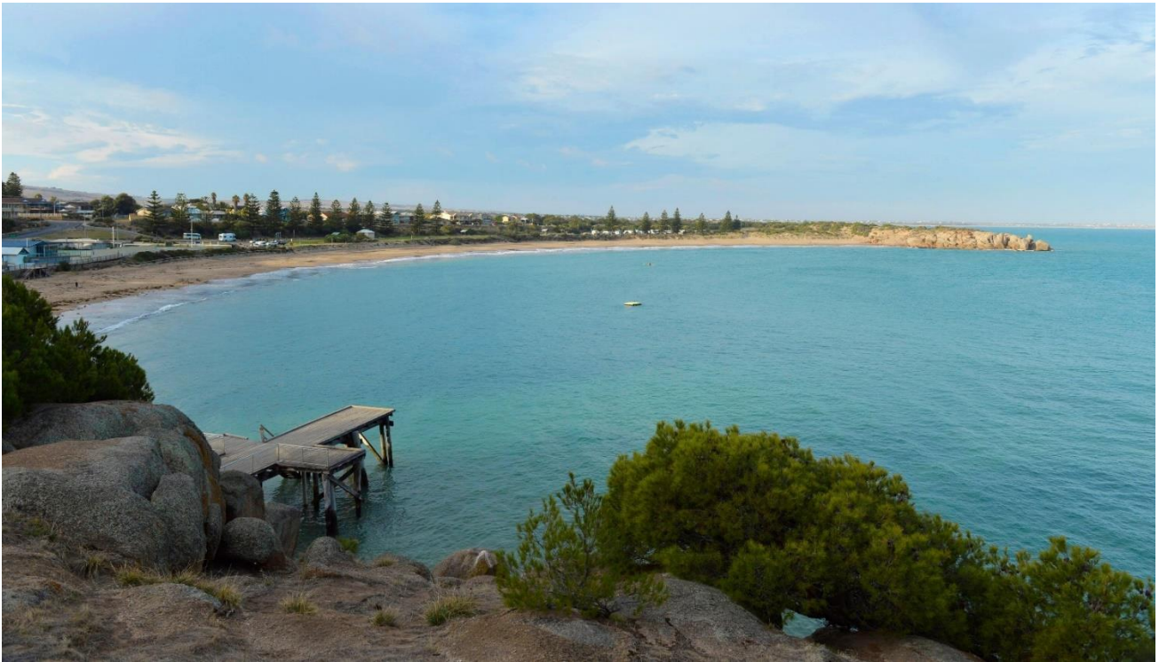
Horseshoe Bay, Port Elliot, Fleurieu Peninsula