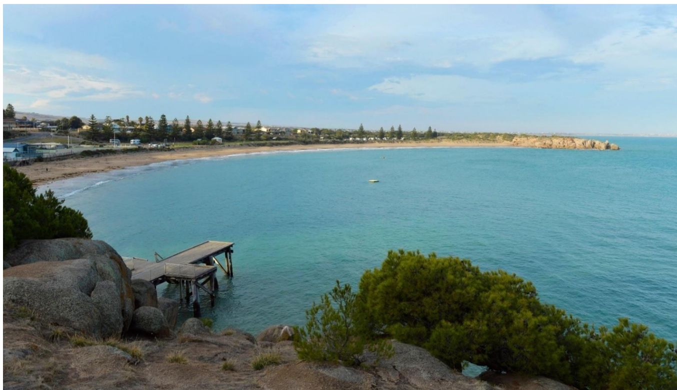
Horseshoe Bay, Port Elliot, Fleurieu Peninsula